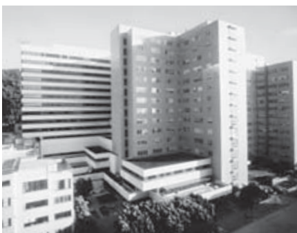
UC San Francisco