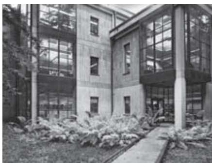
UC Santa Cruz