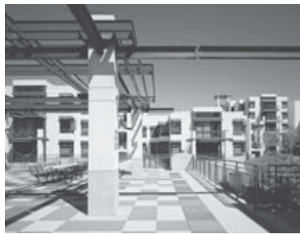
UC San Diego