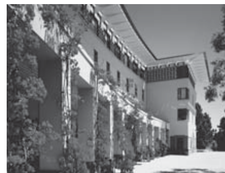
UC Santa Barbara

STUDENT FINANCIAL SERVICES MU 201W, Box 0246 476-4181 TOUR INFORMATION 476-3457